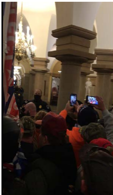
Another photograph from BAUER'S phone depicts the crowd inside the crypt: